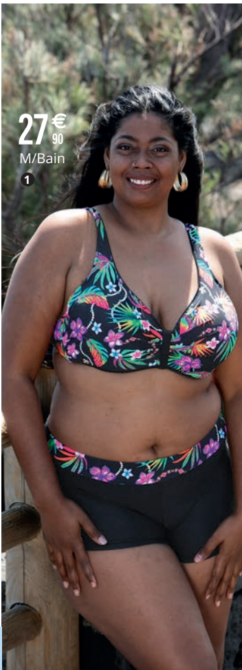
27€ 90 M/Bain 1