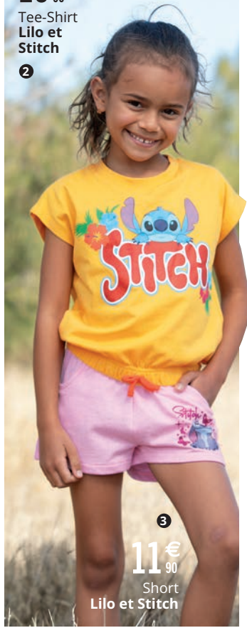
3 11 € 90 Short Lilo et Stitch

1. M/Bain Lilo et Stitch 82% Polyester 18% Elasthanne 6/12A - 2. Tee-Shirt Lilo et Stitch 100% Coton 6/12A - 3. Short Lilo et Stitch 60% Coton 40% Polyester 6/12A - 4. Boardshort Paw Patrol 100% Polyester 3/8A - 5. Ens.Paw Patrol 95% Coton 5% Viscose 3/6A - 6. Ens. Mickey 100% Coton 3/6A - 7. Ens. Minnie 100% Coton 3/8A - 8. Chapeau Minnie Papier 52/54