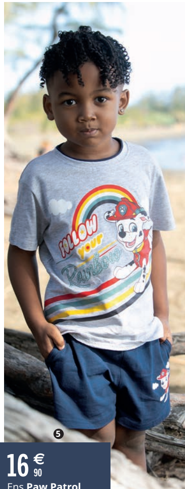
5 16 € 90 Ens Paw Patrol