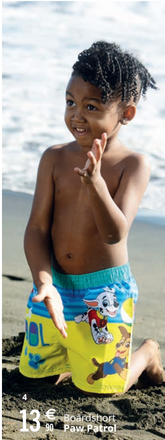
4 13 € 90 Boardshort Paw Patrol